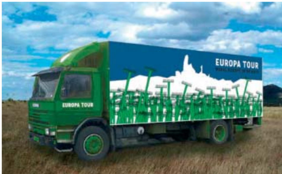
Artist-impression of the 'Tourbus'.

for to the Province of Northern Holland and the Community of Beverwijk. Now we are searching for support in the other EU countries. We will also ask for support among enterprises and private persons. For the success of the Tour it is necessary to have the commitment of many people in a lot of countries. It is possible to become spiritual owner of a part of the Europatour by sponsoring some kilometres. One kilometre costs € 8,70. 1100 km have to be sponsored yet.