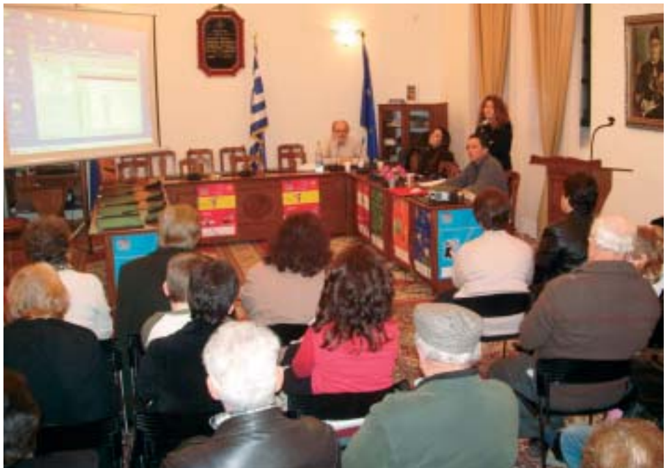
Celebration in the meetingroom of the Paxos municipality

On the last day we will make a conference on the same theme as in Kilingi-Nömme in order to explain to the people in Brittany what they learned there. At the end a little cocktail party will be organized with specialities prepared by persons from the different European countries who live in central Brittany.