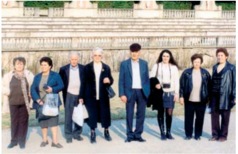
Elderly people from Paxos in Florence

The purpose of the meeting – as the group's tutor stated – was to help make the group members feel proud about their work and about their many achievements through the Anchise Program and to inform the local community