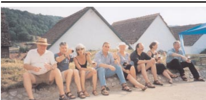
The wine feast of Palkonya on Whit Monday became an international meeting. Guests from Wijk aan Zee and Mellionec came to Palkonya to taste the new wine harvest.