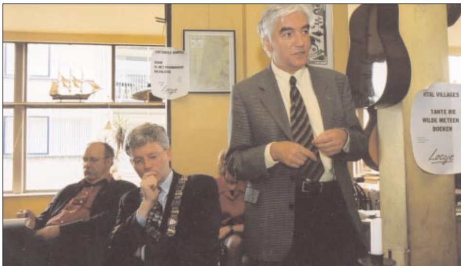
Member of European Parliament Max van den Berg (Social democrat) speaking during the presentation of the book Vital Villages in Wijk aan Zee.

Cor Hienkens, alderman of Beverwijk who accompanied the Wijk aan Zee delegation to the village festival on September 21st in Aldeburgh, has offered all the villages two copies of a new map of Europe, the 'Europe of the villages'. The map is supposed to end up in the schools of the villages involved.