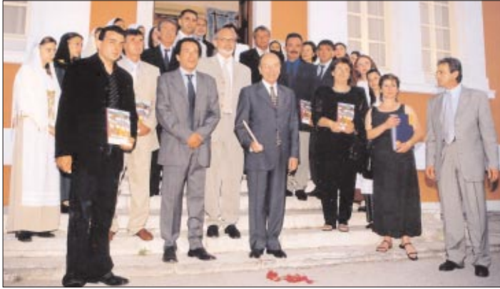
In the middle: Konstantinos Stefanopoulos during his visit to Paxos.

Paxos has had a good start of 'it's' year. The small island near Gaios is getting a facelift. The ministers of agriculture have visited the island in April. President Konstantinos Stefanopoulos came in may and is planning to be at the opening conference in April. He has become a patron of Cultural Village. The conference on 16-19th of april will be dedicated to the theme 'water'. A real problem on the island, because it does not have wells and is completely dependent on rainfall.