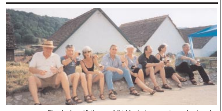
The wine feast of Palkonya on Whit Monday became an international meeting. Guests from Wijk aan Zee and Mellionec came to Palkonya to taste the new wine harvest.