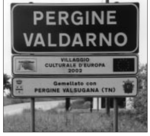
Pergine Valdarno making a clear statement being Cultural Village.

The day after, the closing conference was held,