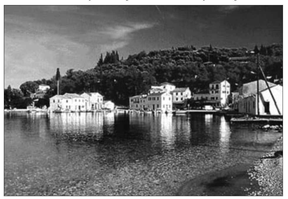
The harbour of Loggos, Paxos.

He is looking forward to 2004, when Paxos will be the host village for Cultural Village. The preparations have already started. A book will appear about the history of water in Paxos. And the singers and dancers of the island practise regularly to perform well in 2004. The guests from all over Europe will be given a tour and